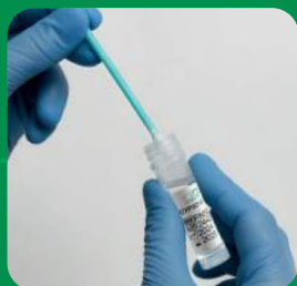
Vigorously rotate the swab to release the DNA