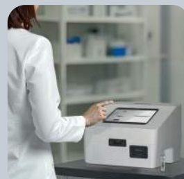
Tested on the Genedrive® System