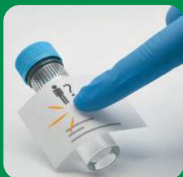
Complete patient ID label attach to collection tube